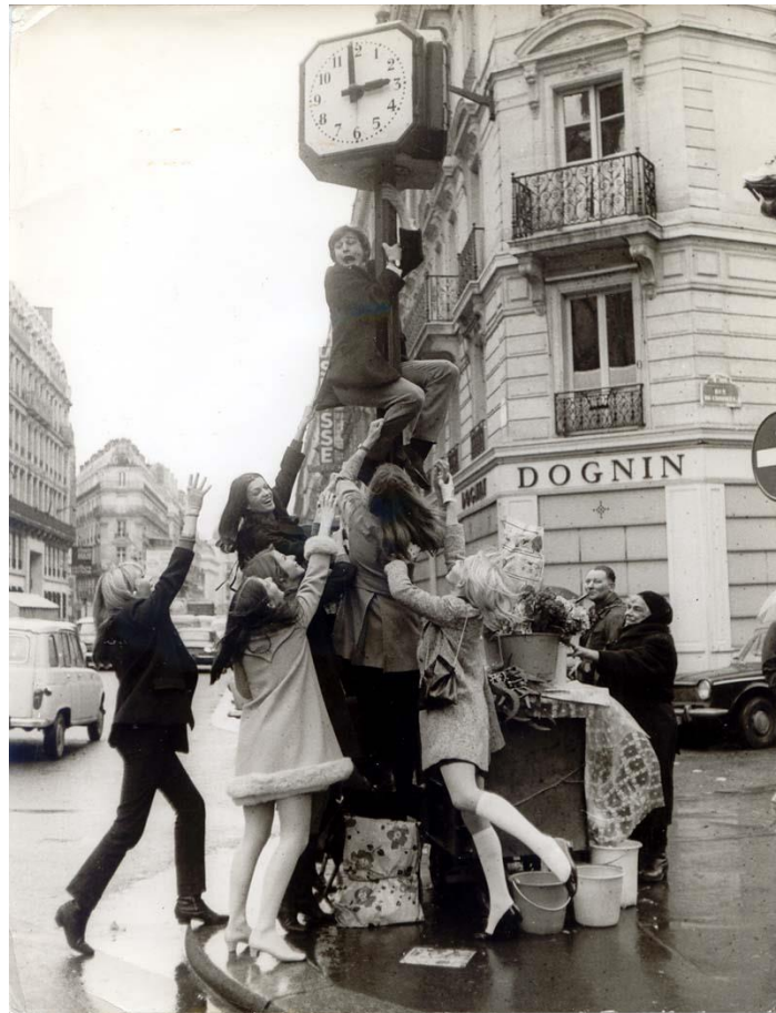
Rosko and Fans

You've got to have somebody to give you pointers so to speak, so you take from them what you hear on the air, and I took from the best. And over the years of course you lose a little bit of what you originally plagiarised and you develop your own style but that's much further down the line. I never did; I'm still plagiarising like crazy but I think I do it in a style that is not overtly offensive. So we're on this little theme of what is a DJ and everybody's a DJ. You get a kid that goes to a gymnasium at school with a couple of turntables and he's a DJ - even though he never says anything! You've got these fellas doing non-stop music and raves. They're not DJs. They don't talk; they don't control the crowd with their brain; they control the crowd emotionally through music. Now don't get me wrong; I admire all pros at all levels doing all types of things. A real DJ though is someone who speaks; controls a crowd with speech as well as music. The guys who do the trance and the raves and those type of things usually control the crowd through the expertise of mixing music and