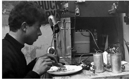
Dick Dickson.

peak and low tide. I don't suppose the losses were much more than 10%, but using a 'washing line aerial' rather than a vertical may have added to this problem.