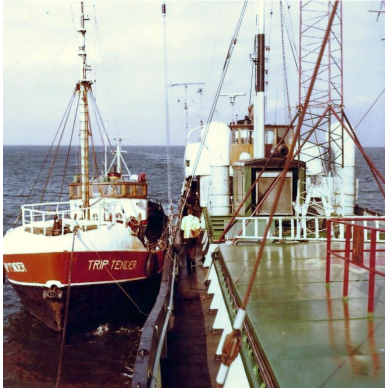
Trip Tender alongside MEBO II