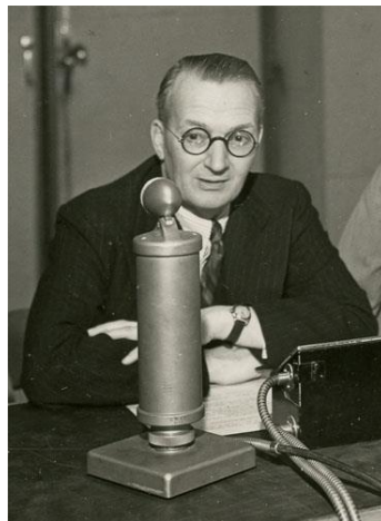
Christopher Stone Archive Radio Luxembourg